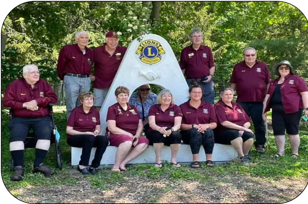
The St. Thomas Lions Friendship Arch