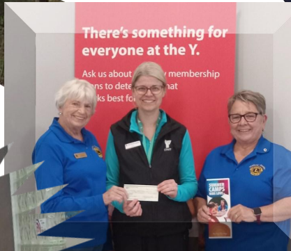
Send Kids to Y camp