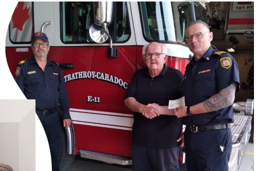
Fire Assoc. for Hazmat supplies