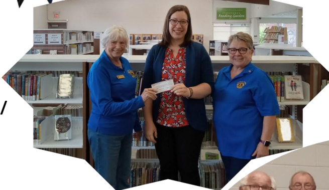
Table & Chair pod / display centre for Strathroy Library