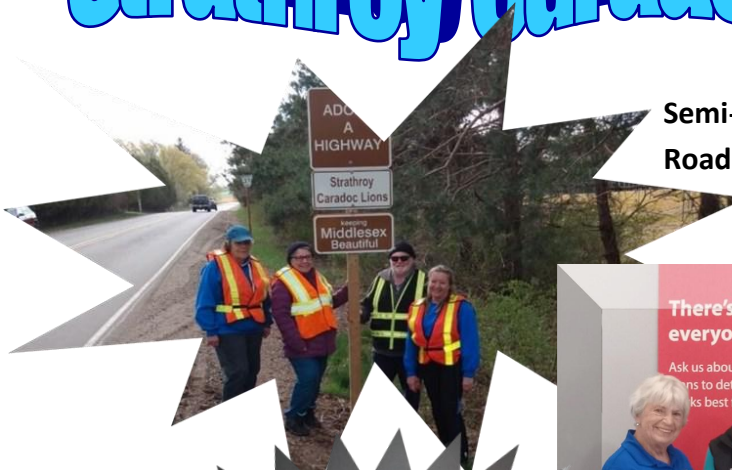
Semi-Annual Road cleanup