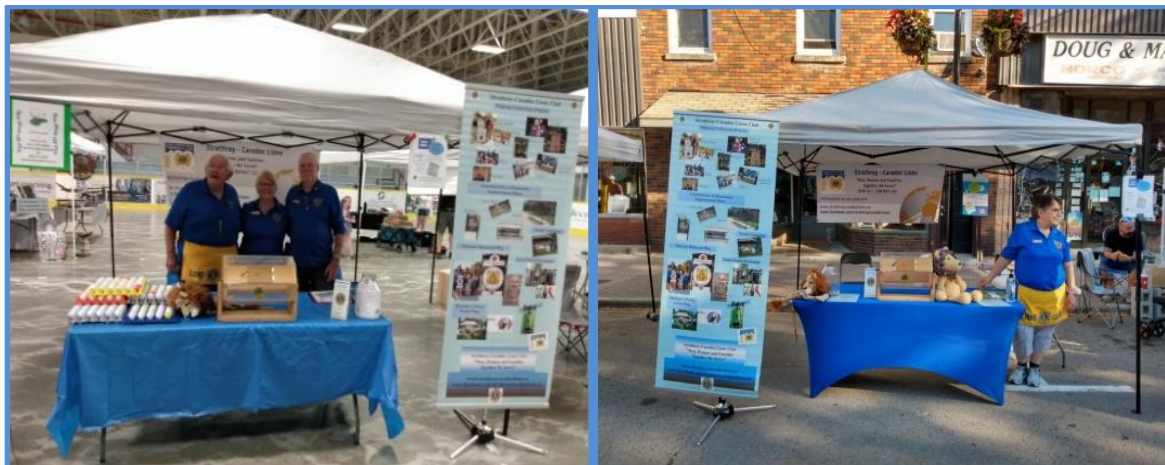
Below Right: Outdoor Market