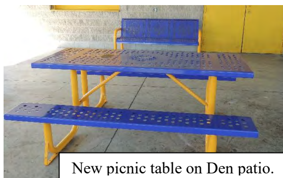
New picnic table on Den patio.