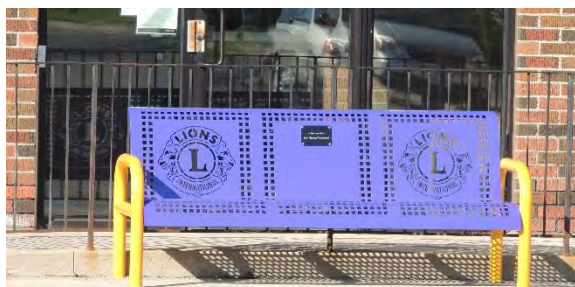
New Lion's bench in front of medical building.