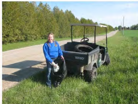
Strathroy-Caradoc Lions Community Service Day