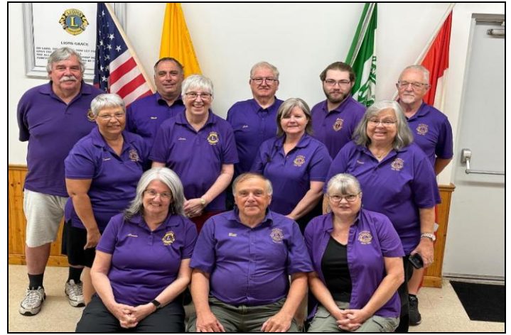
Top Left: July 1st Canada Day Parade Petrolia Ont