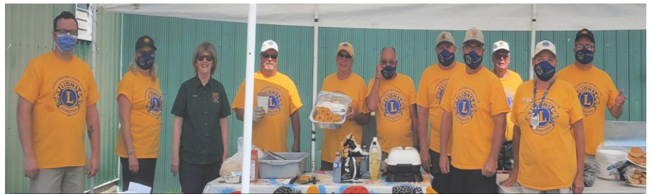
Dorchester Lions – Served the Meal – Peameal Bacon on Bun, Fries, Dessert

NEXT District A-1 Cabinet Meeting October 18 th , 2020 in Windsor