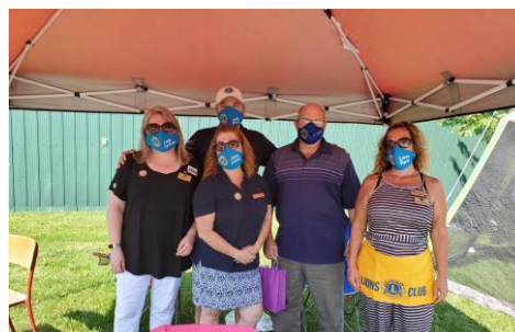
Hyde Park Lion at the Cabinet!

NEXT District A-1 Cabinet Meeting October 18 th , 2020 in Windsor