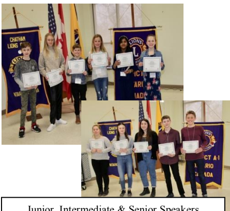
Junior, Intermediate & Senior Speakers March 2020