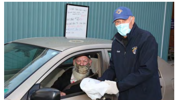
Lion George Arts – Delivering Dinner to Customer