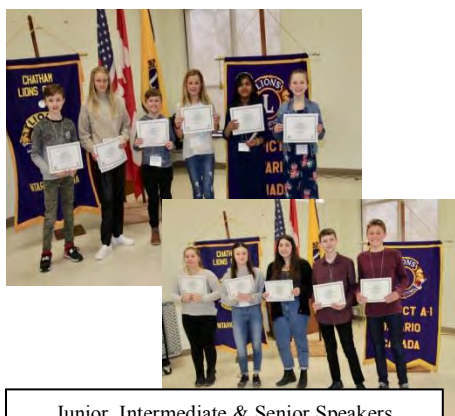
Junior, Intermediate & Senior Speakers March 2020