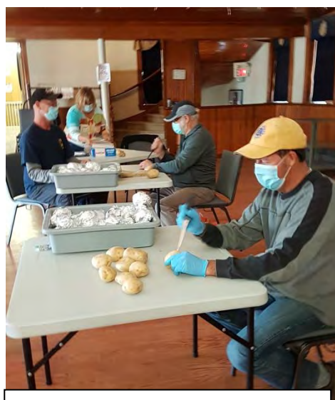
Potato wrappers busy in the morning!