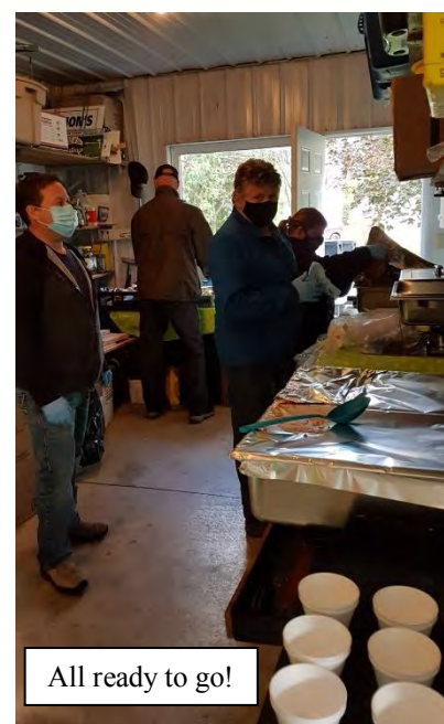
All ready to go!